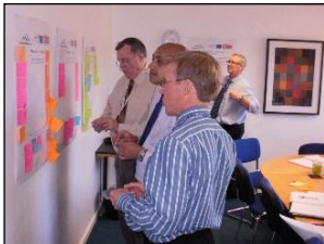
MAA experts teach technology roadmapping to an MAA member company