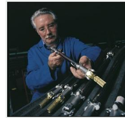
Collins Aerospace Airbus A320 wing flight control system