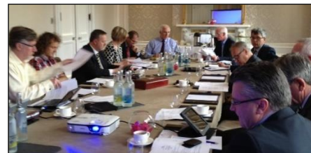
MAA board meeting

We represent all members of the Midlands aerospace community in dialogue and strategy development, so we can make our local and regional economic ecosystems work better and maximise the effectiveness of the business and government resources available to companies in the Midlands. We work closely with the other UK regional aerospace alliances, we support the UK's Aerospace Growth Partnership (led by the national aerospace body ADS and the government department BEIS) and we are an active member of the 45-strong European Aerospace Cluster Partnership.