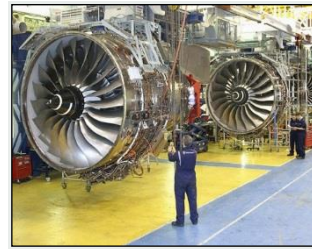
Rolls-Royce Trent 1000 engine for Boeing 787

More than 300 organisations belong to the MAA, ranging from global players Meggitt, Moog Aircraft Group, Rolls-Royce and Collins Aerospace to small supply chain companies and key regional partner bodies.