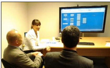
MAA members learn best practice in how to control manufacturing priorities from Meggitt