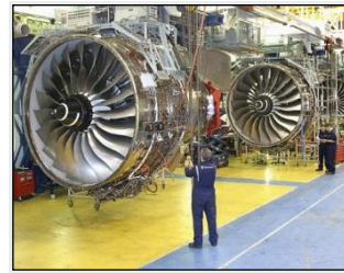
Rolls-Royce Trent 1000 engine for Boeing 787

More than 300 organisations belong to the MAA, ranging from global players Meggitt, Moog Aircraft Group, Rolls-Royce and Collins Aerospace to small supply chain companies and key regional partner bodies.