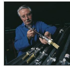
Collins Aerospace Airbus A320 wing flight control system