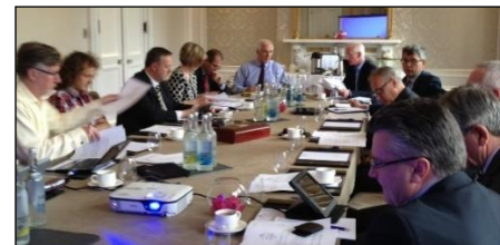
MAA board meeting

We represent all members of the Midlands aerospace community in dialogue and strategy development, so we can make our local and regional economic ecosystems work better and maximise the effectiveness of the business and government resources available to companies in the Midlands. We work closely with the other UK regional aerospace alliances, we support the UK's Aerospace Growth Partnership (led by the national aerospace body ADS and the government department BEIS) and we are an active member of the European Aerospace Cluster Partnership.