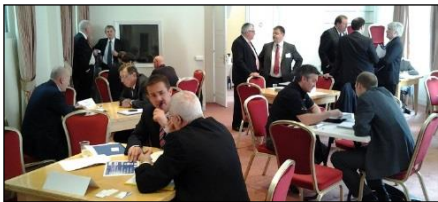
50 1-to-1 meetings for MAA members with French aerospace giant Safran, British embassy, Paris