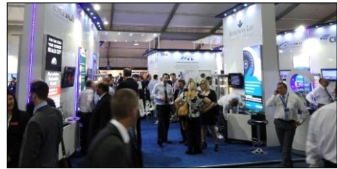
Business was brisk for the 25 companies exhibiting with the MAA at Farnborough 2018