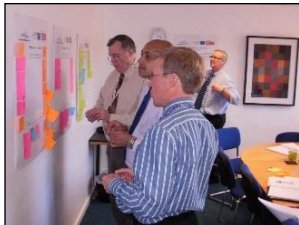
MAA experts teach technology roadmapping to BHR Group