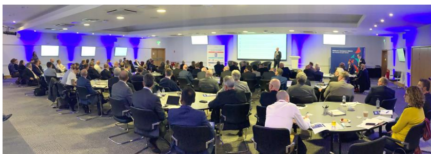
Midlands Aerospace Alliance Annual Conference at the Learning and Development Centre, Rolls-Royce, Derby