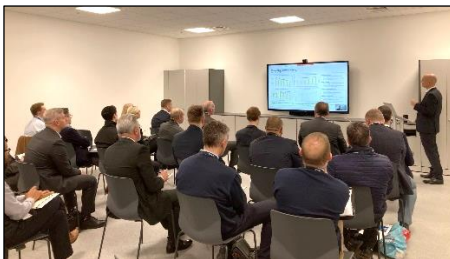
MAA members learn from global aerospace Tier 1 – Parker Meggitt