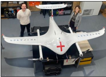
One of 100+ Aerospace UP R&D funding projects, with University of Nottingham