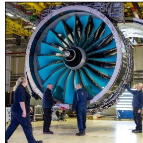
Rolls-Royce Ultrafan Aero Engine Demonstrator

More than 270 organisations belong to the MAA, ranging from global players ITP Aero UK, Parker Meggitt, Moog Aircraft Group, Rolls-Royce and Collins Aerospace to small supply chain companies and key regional partner bodies.