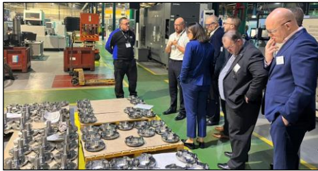
Visit to CBE Plus for MAA AGM