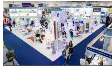
Business was brisk for the 27 companies exhibiting with the MAA at Farnborough