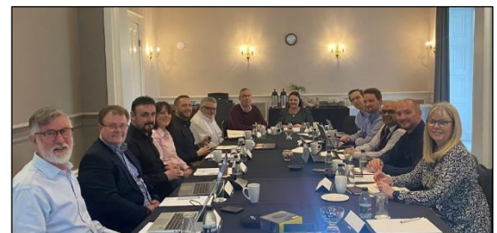
MAA board meeting

EACP EUROPEAN AEROSPACE CLUSTER PARTNERSHIP