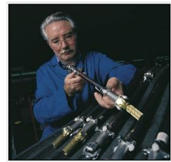
Collins Aerospace Airbus A320 wing flight control system