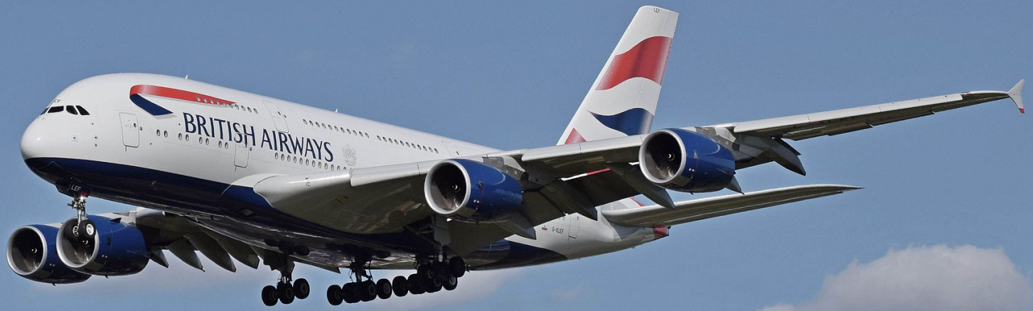
British Airways Airbus A380 (G-XLEF) arrives London Heathrow 11 April 2015