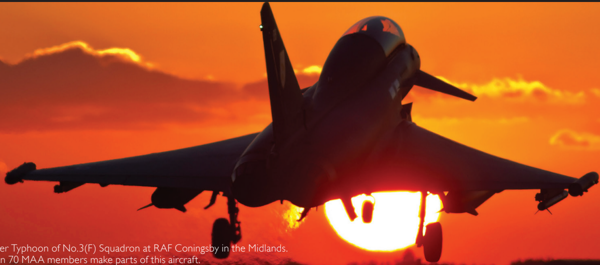
Eurofighter Typhoon of No.3(F) Squadron at RAF Coningsby in the Midlands. More than 70 MAA members make parts of this aircraft.